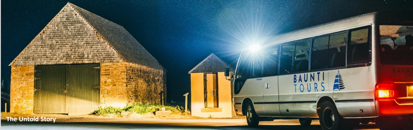
The Untold Story