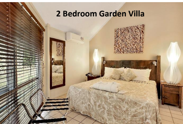
2 Bedroom Garden Villa