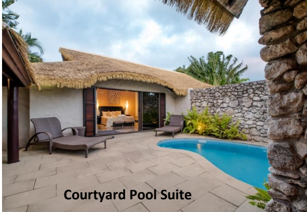
Courtyard Pool Suite