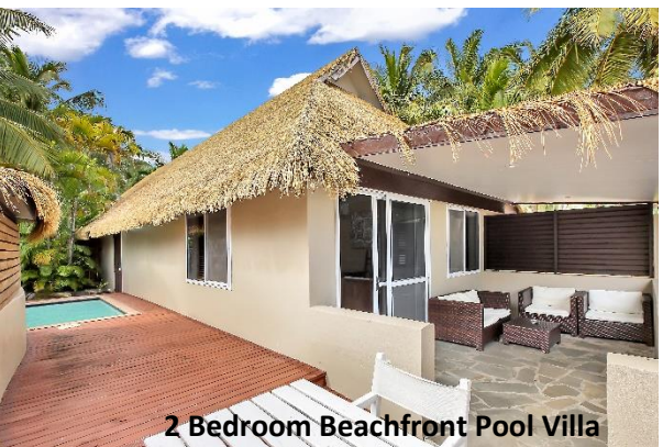
2 Bedroom Beachfront Pool Villa