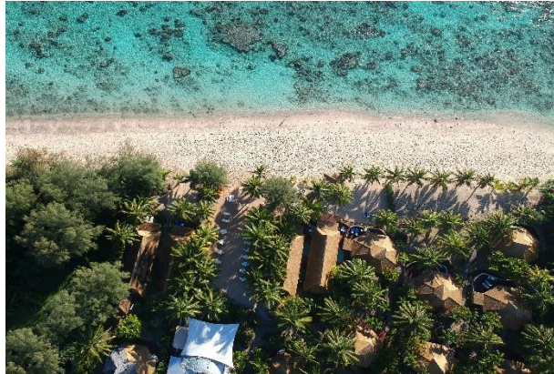
1 Bedroom Garden Villa

Private courtyard villas with high stone walls complete with private garden. Ideal for Honeymooners, Wedding Couples or those simply wanting to experience privacy and luxury at its best. The spacious Courtyard Pool Suites feature their own pool, mini-waterfall and outdoor dining pavilion. The open plan suites feature a king size [unzippable] bed, lounge area with entertainment centre and an elegant bathroom with your very own claw foot bath as well as twin monsoon rain shower with a separate toilet and vanity and are fully air-conditioned. The kitchenettes feature a microwave, kettle and tea and coffee making facilities, toaster and mini fridge. Extra bedding can be arranged to accommodate one additional adult in the open plan lounge area at an additional charge of NZ$100 per person per night. Maximum Occupancy - 3