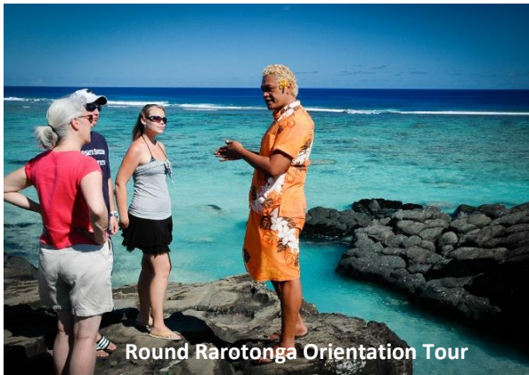
Round Rarotonga Orientation Tour

Located on the South Coast of the island, these lush gardens contain many local plants & flowers that are not only beautiful and colourful but are of medicinal uses as well. The on-site café is great too and be sure to taste the cheesecake, claimed to be the best in Raro.