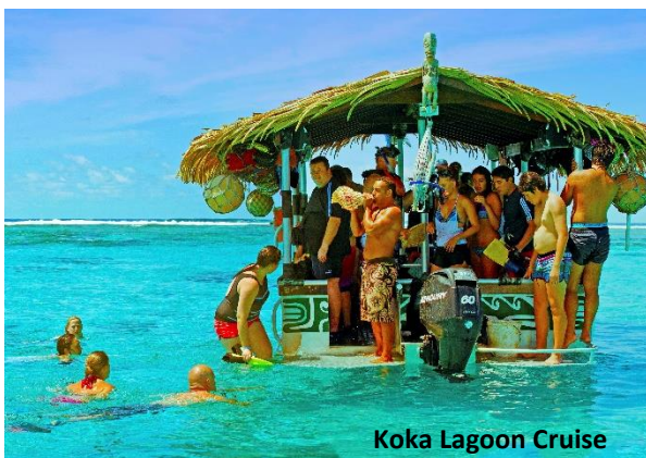
Koka Lagoon Cruise