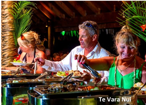
Te Vara Nui