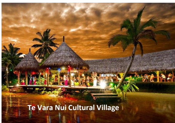
Te Vara Nui Cultural Village