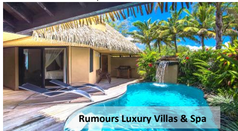
Rumours Luxury Villas & Spa

Need a little something to sweeten the deal ? Book a stay for 5 nights or more between 01 Feb - 30 Jun 2020 ( sales to 28 Feb 2020 ), and your clients will enjoy a decadent 3½ hour spa treatment for two and a mouth-watering sunset mixed platter absolutely FREE – total value NZ$980 !!