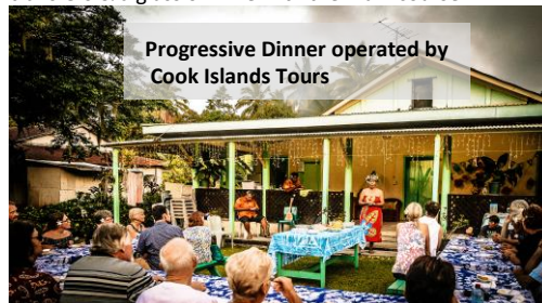
Progressive Dinner operated by Cook Islands Tours

The Progressive Dinner through Island Homes is a 'must ' do experience in Rarotonga. This dinner gives customers a real glimpse into the local life & food - 3 courses in 3 different local homes with a string band accompanying the tour all the way. Each home prepares their local dishes & you're sure not to be left hungry. NZ$99 per adult is great value for this dinner experience that includes transfers & a glass of wine with the main course.