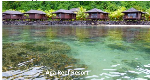
Aga Reef Resort

The resorts Reef Restoration project is in full swing and to date some 140 corals have been planted in the nursery, that sits inside the lagoon, between the Waterfront Villas and the island. There's 2 resident turtles here (spotted almost daily ), clams and loads of colourful coral fish.