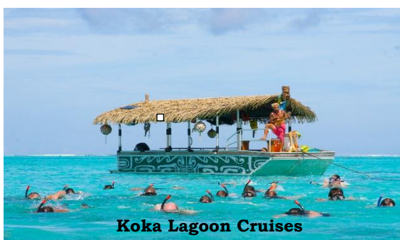
Koka Lagoon Cruises