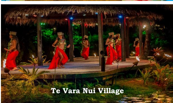
Te Vara Nui Village